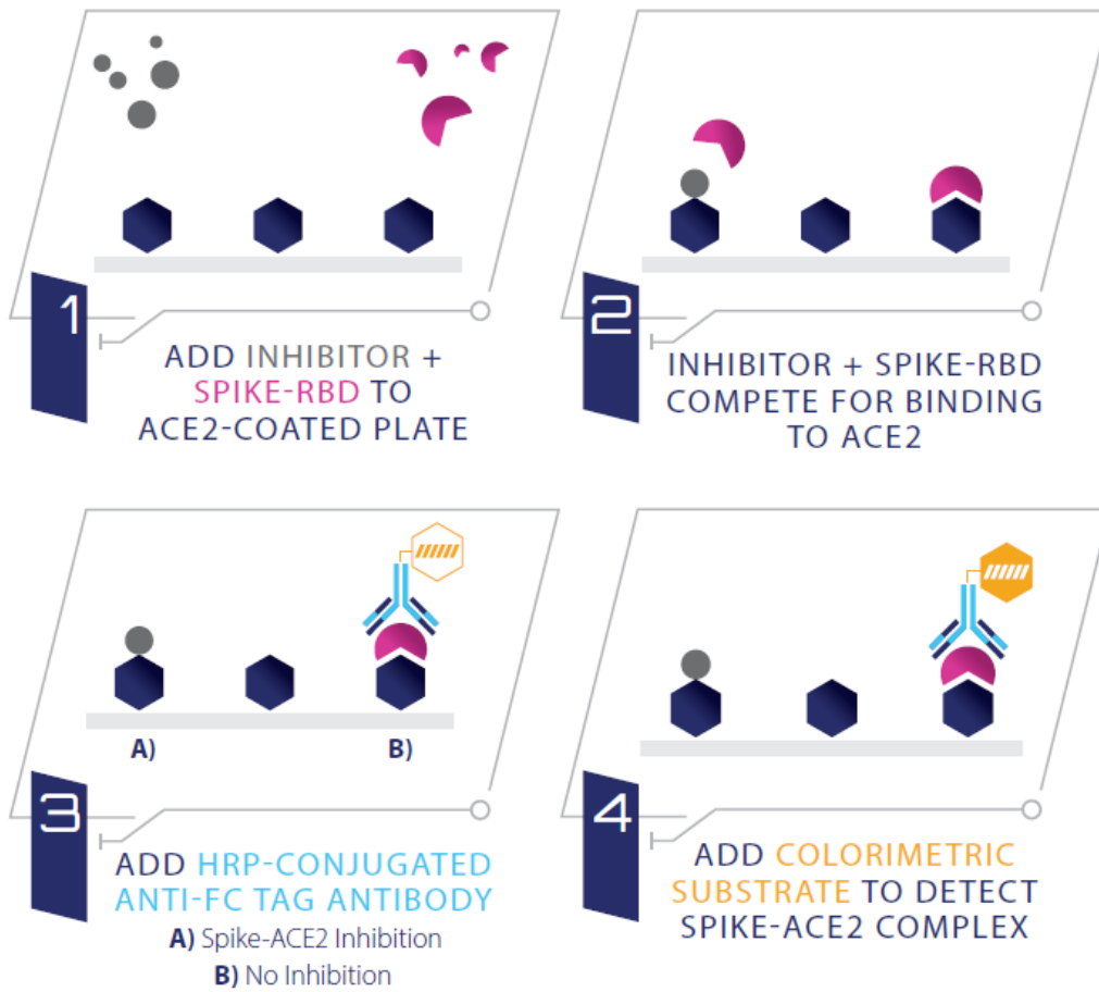
A schematic showing how the RayBio® Spike-ACE2 Binding Assay Kit II can measure the inhibition of the Spike RBD and ACE2 interaction in the presence of a potential inhibitor.